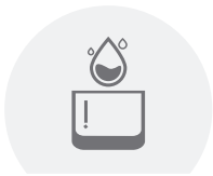
Easy-to-Fill Water Chamber